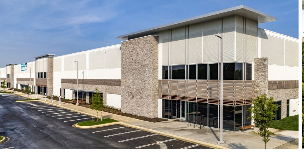
700 Progress Way

2-Building, 495,000 SF Research & Industrial Park