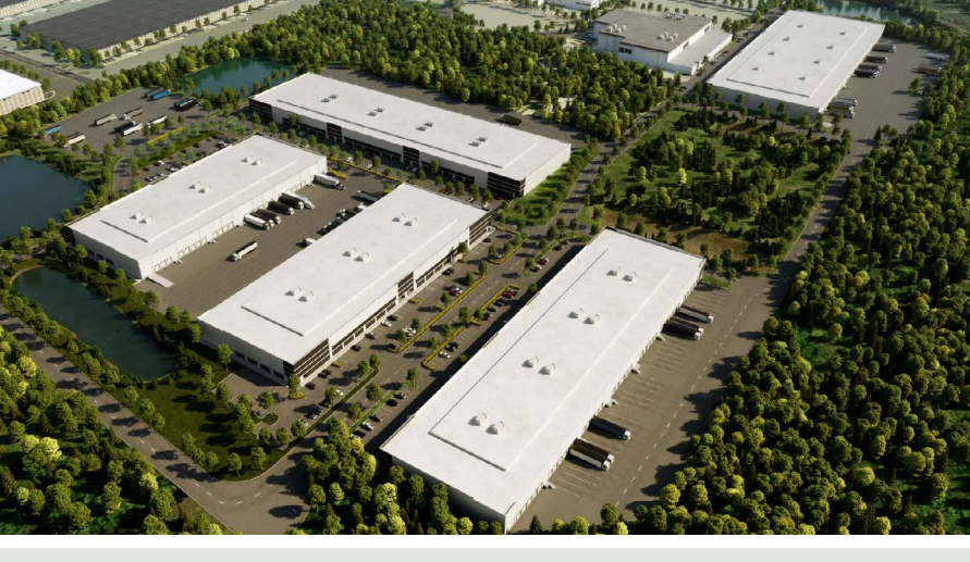
Northlake II 5-Building, 655,000 SF Industrial Park