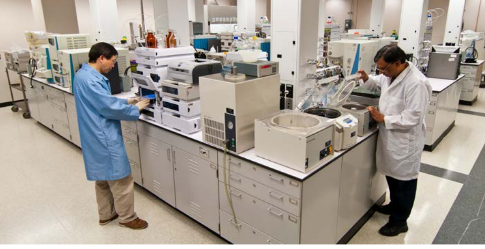
NIAID/VCR Vaccine Pilot Plant Operated by SAIC-Frederick