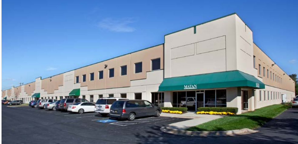
Matan Headquarters Wedgewood II